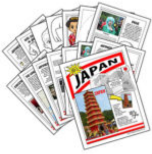
JAPAN INTERNATIONAL DOWNLOAD