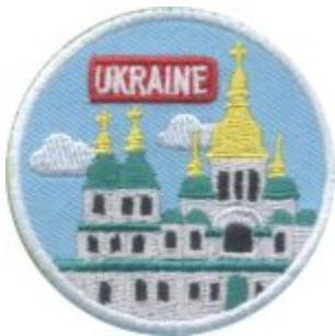
UKRAINE LANDMARK PATCH PROGRAM®