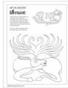
UKRAINE ANCIENT ARTWORK WORKSHEET