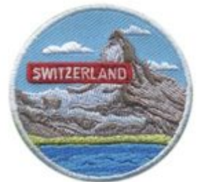
SWITZERLAND LANDMARK PATCH