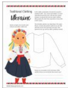
UKRAINE CLOTHING WORKSHEET DOWNLOAD