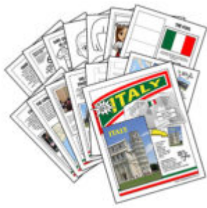
ITALY INTERNATIONAL DOWNLOAD