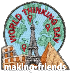
WORLD THINKING DAY FUN PATCH WITH LANDMARKS