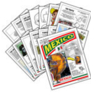
MEXICO INTERNATIONAL DOWNLOAD