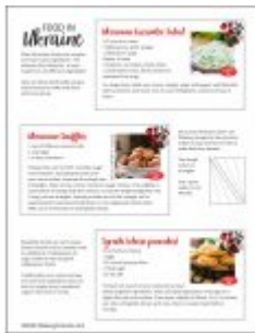
UKRAINE RECIPE DOWNLOAD