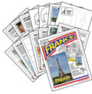
FRANCE INTERNATIONAL DOWNLOAD