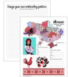
UKRAINE EMBROIDERY WORKSHEET