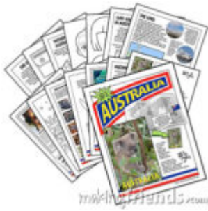
AUSTRALIA INTERNATIONAL DOWNLOAD