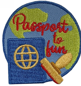
PASSPORT TO FUN PATCH