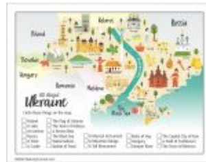
UKRAINE MAP SCAVENGER HUNT DOWNLOAD