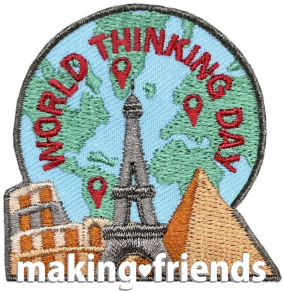
WORLD THINKING DAY FUN PATCH WITH LANDMARKS