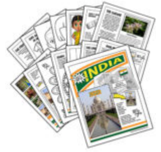
INDIA INTERNATIONAL DOWNLOAD