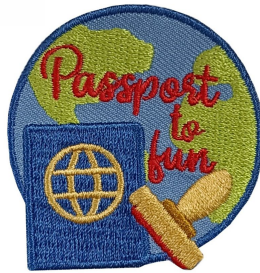
PASSPORT TO FUN PATCH