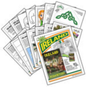
IRELAND INTERNATIONAL DOWNLOAD